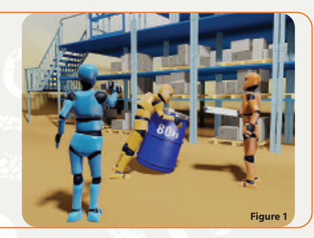
Figure 1 shows a warehouse employee manually handling a large barrel. The employee hunches over and grips both sides of the barrel; slowly and with great effort and strain the employee tilts the barrel back slightly, and then forward using the weight of their body.

Following a risk assessment of this manual handling task a number of risk factors are identified. The physical effort is too strenuous; the barrel is difficult to grasp, being both too heavy and too large. Figure 2 illustrates these risk factors.