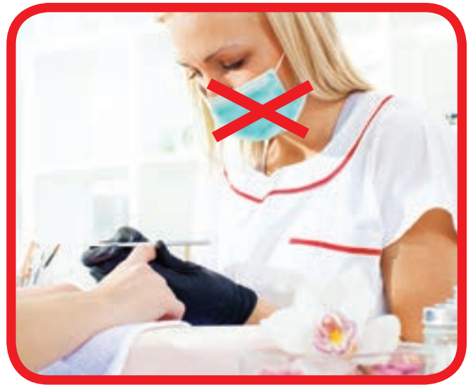
Surgical masks do not give adequate protection from nail products