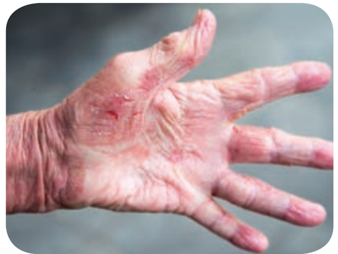
Dermatitis on the hand

Toluene found in some nail polishes is suspected of damaging fertility. Dibutyl phthalate (DBP) used to stop nail polish cracking is banned in Europe. It is dangerous for pregnant women.