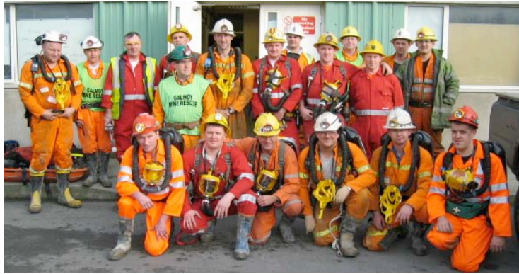
Tara-Lisheen-Galmoy joint training at Galmoy Mine in November 2004