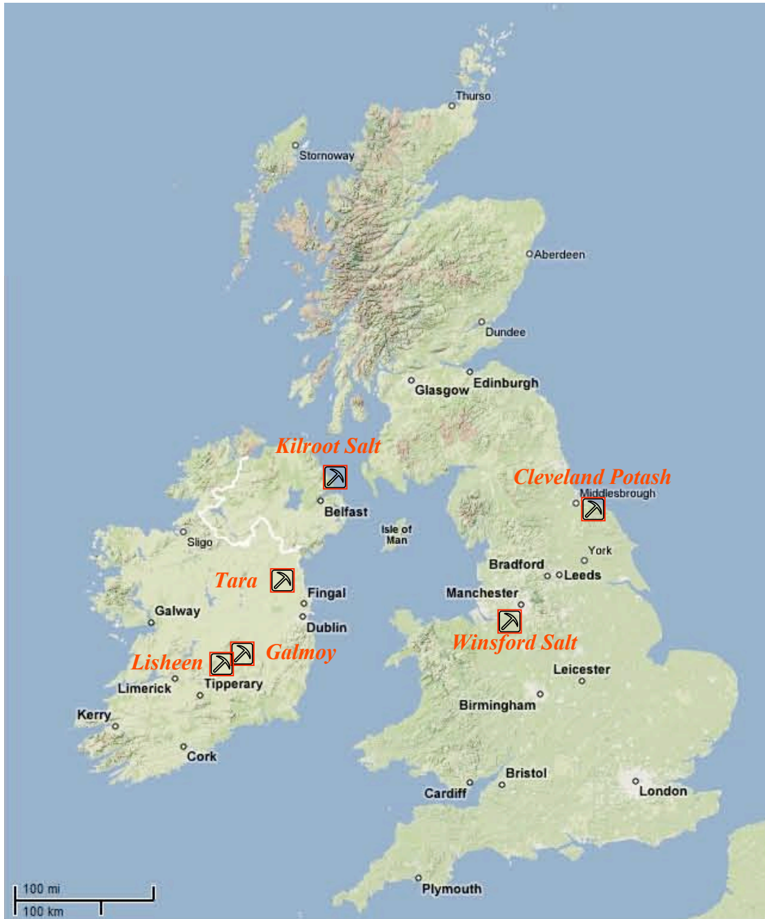
Figure 2. Map of Ireland and Britain showing the location of mines currently involved in the annual mine rescue competition.